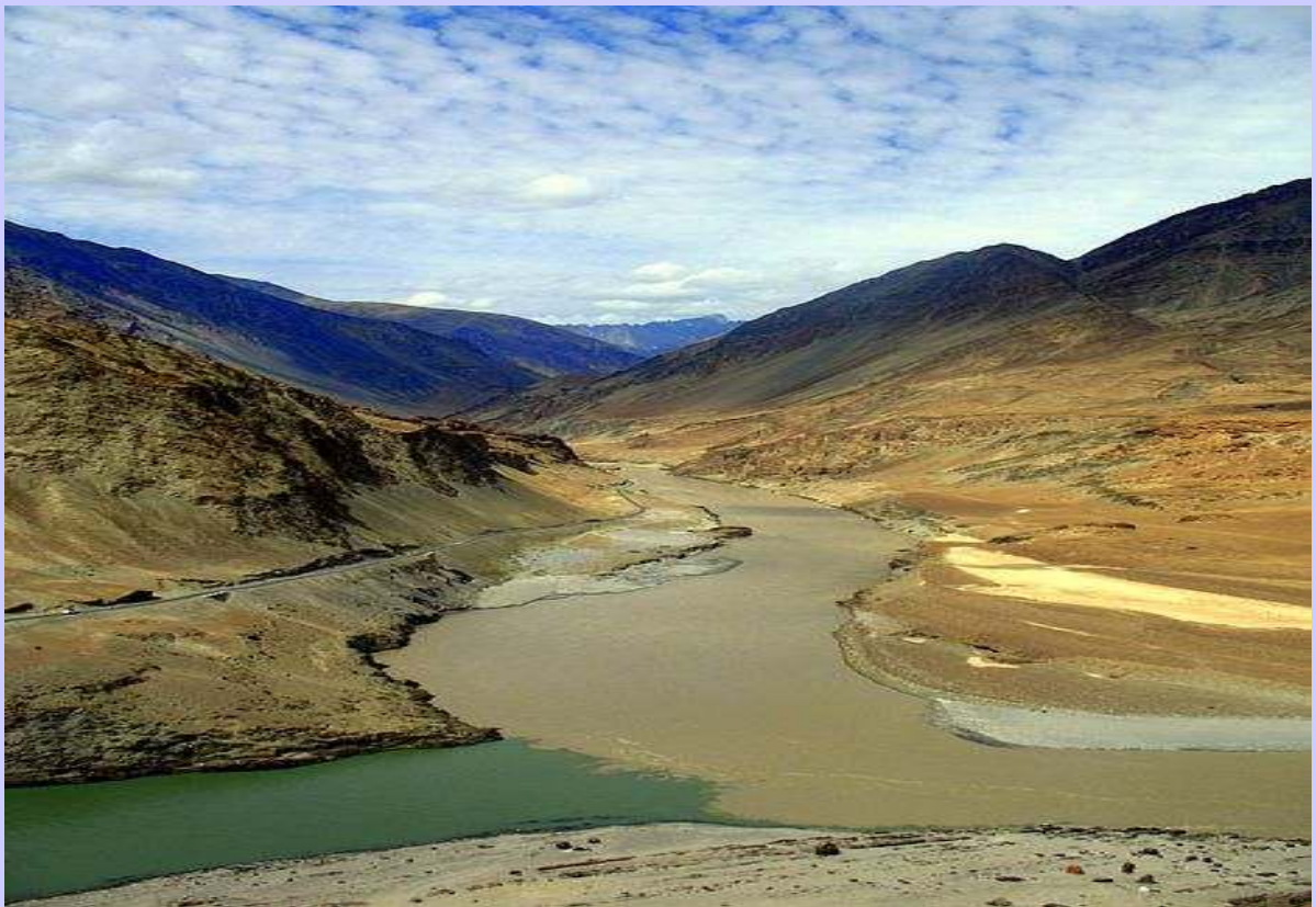
Confluence of Zaskar and Indus Rivers