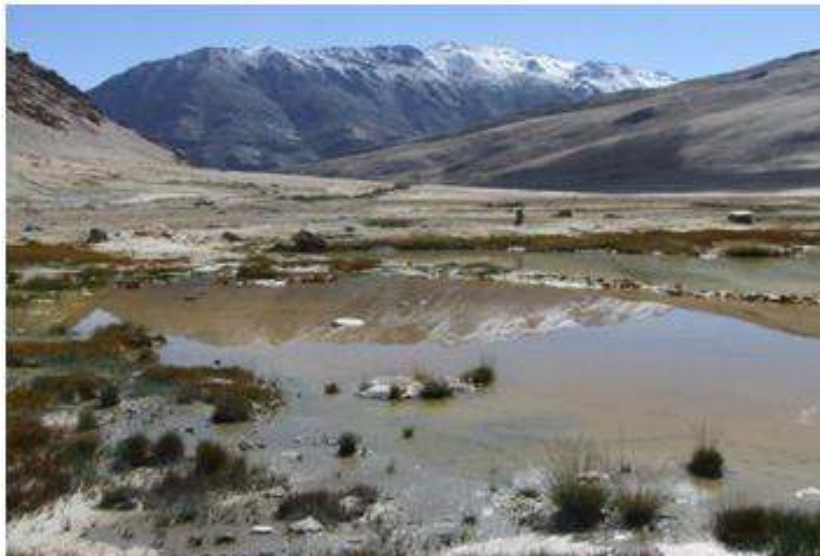
Pugah Geothermal Fields